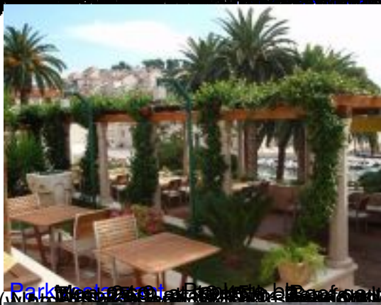
Park Hotel restaurant - 100€ per person including wine and Bourgogne sauce (Menu: 100€) - 100€ per person including wine and Bourgogne sauce