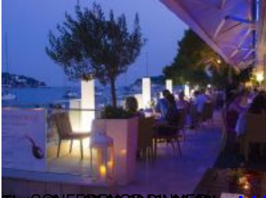
Adriana hotel, Restaurant Val Marina This CONFERENCE DINNER was held at the Adriana hotel, Restaurant Val Marina. The menu included: Baked chicken with Bourgoigne sauce and peppercorn sauce . The drinks were Sparkling wine and Red wine .