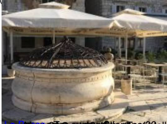
Park Hotel restaurant - 100€ per person including wine and Bourgogne sauce (Menu: 100€) - 100€ per person including wine and Bourgogne sauce