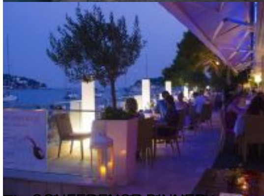
Thurs CONFERENCE DINNER at Adriatic hotel, Restaurant Val Marina (Menu: 100€) - 100€ per person including wine and Bourgogne sauce Friday 20th June 2019 - 100€ per person including wine and Bourgogne sauce Saturday 21st June 2019 - 100€ per person including wine and Bourgogne sauce