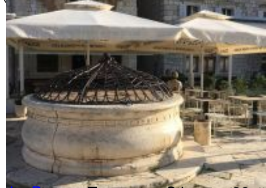
Park Hotel This CONFERENCE DINNER was held at the Park Hotel. The menu included: Baked chicken and Baked potatoes . The drinks were Sparkling wine and Red wine . Discounted prices for drinks.

All social events locations on the Hvar map