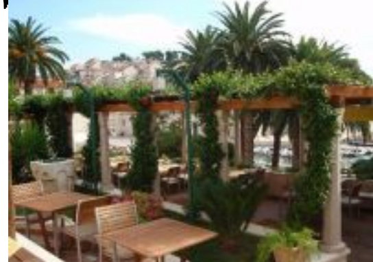
Park Hotel This CONFERENCE DINNER was held at the Park Hotel. The menu included: Baked chicken and Baked potatoes . The drinks were Sparkling wine and Red wine . Discounted prices for drinks.