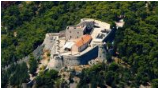
VISIT TO HVAR FORTRESS FORTICA