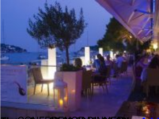
Adriana hotel, Restaurant Val Marina This CONFERENCE DINNER was held at the Adriana hotel, Restaurant Val Marina. The menu included: Chicken with Bourgoigne sauce and petite orange sauce, Beef with the Bourgoigne sauce, and the Bourgoigne sauce.