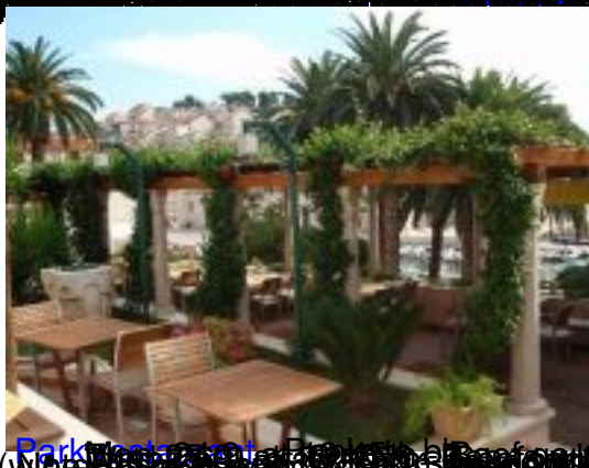
Park Hotel restaurant (Menu: 100€) - 100€ per person including wine and Bourgogne sauce