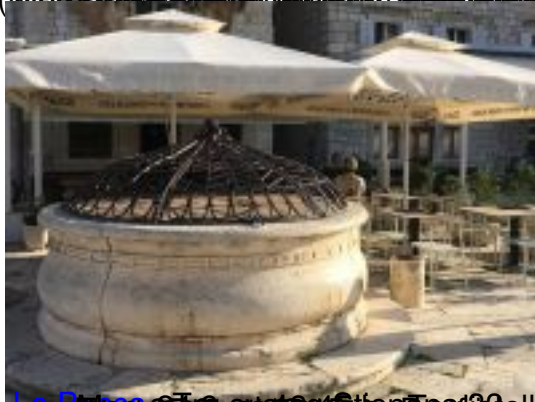
La Paloma restaurant (Menu: 100€) - 100€ per person including wine and Bourgogne sauce

All social events locations on the Hvar map