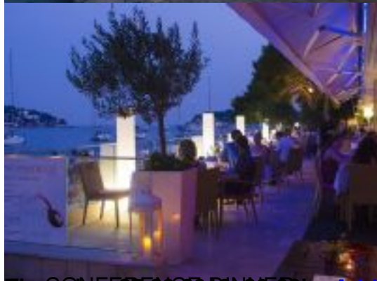
Thurs CONFERENCE DINNER at Adriatic hotel, Restaurant Val Marina (Menu: 100€) - 100€ per person including wine and Bourgogne sauce Friday 20th June 2019 at The Broom (Menu: 100€) - 100€ per person including wine and Bourgogne sauce